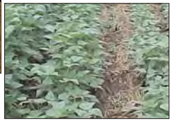
Crops are sown and develop on a mulch.