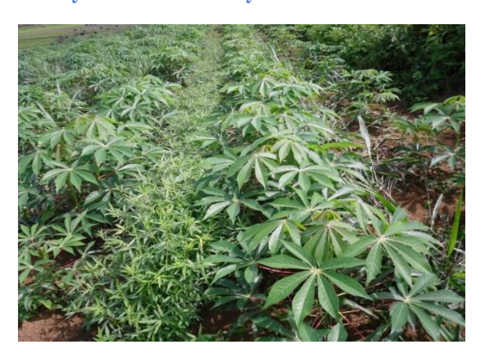
Table 14: Achievements on Conservation Agriculture in the Southeast