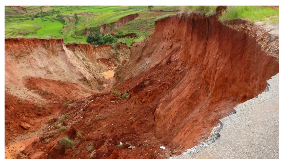
Picture 2: Gulley erosion after high intensity rainfall (feb. 2015) in the project area

Due to recurrent bush burning and mining agriculture practices there is a lot of erosion accelerating this decline of fertility and also almost no more trees for fuel in most of households leading to high use of crop residues for fuel and for livestock.