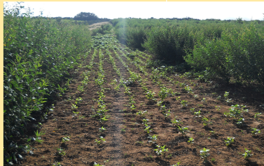
Elagnelagne folo mentatse