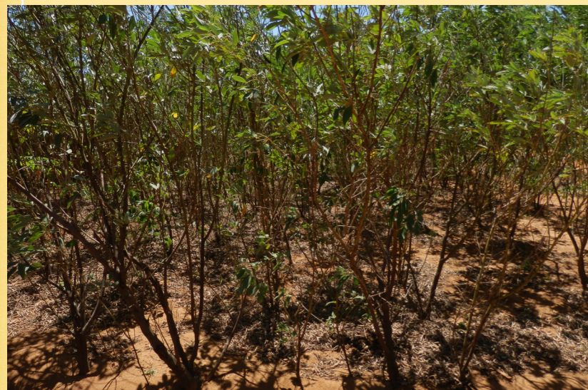
Fameregnagne ty fahatsara ty tane amy ty alala ty fanaovagne ty fam-boleogne alan'ambatry