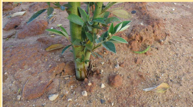
Mitombo ndra te ie amy ty tane mafe