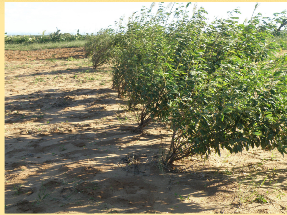
Ambatry feno efa-bolagne