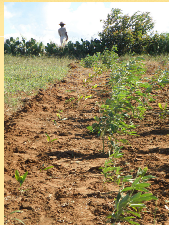
Ambatry mbe kede