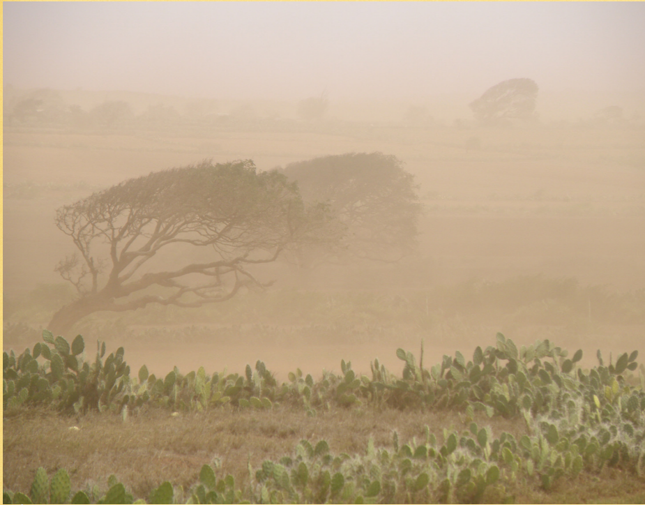
Teteke tsy misy kalan-tioke