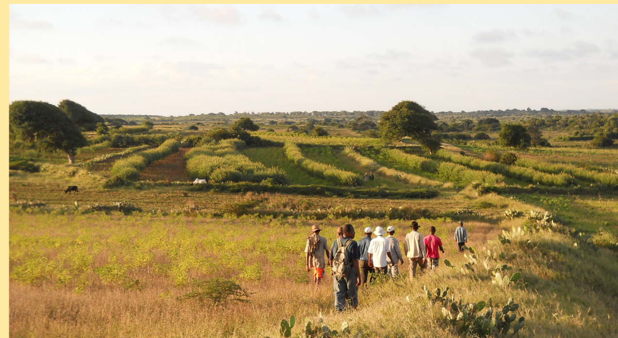
Teteke tena voaaro