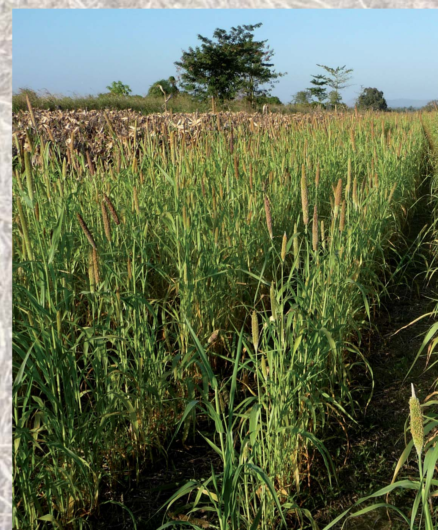
Millet as bio-pump