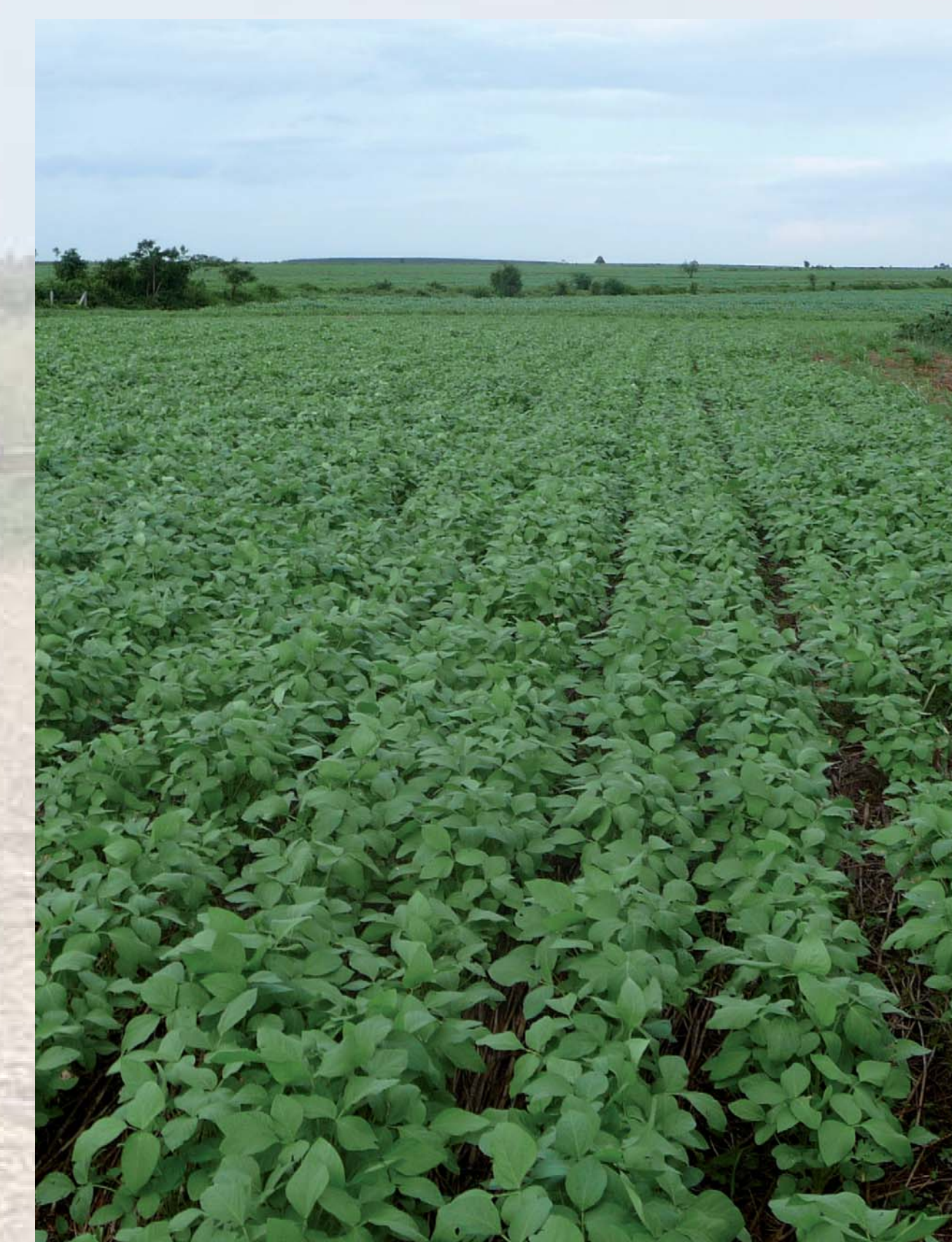
Soybean after millet